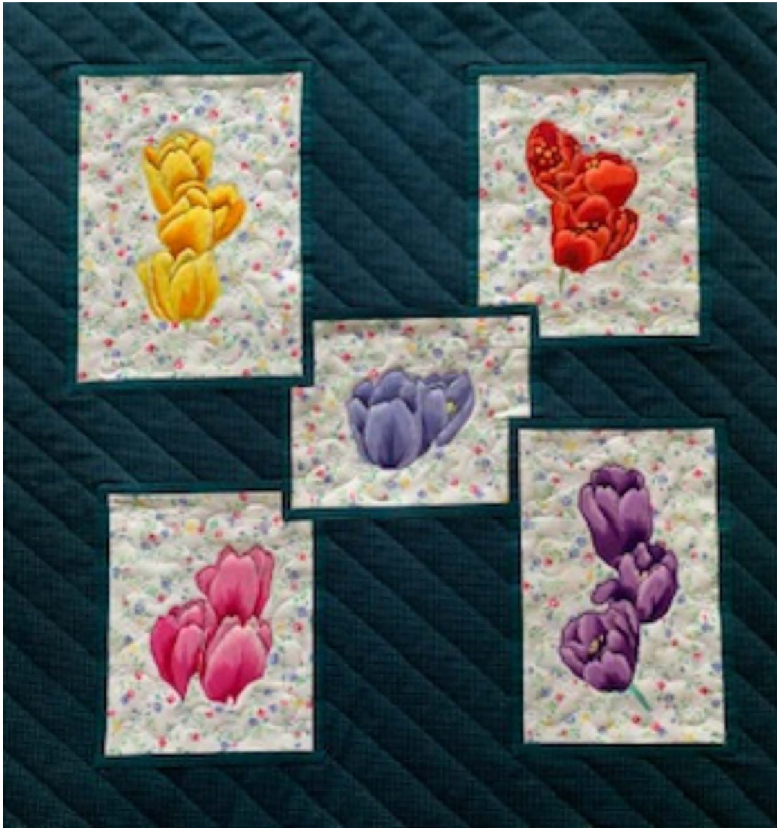
Ann Moody QGBI Region 5 Challenge 'Spring & Five' 24" square cushion