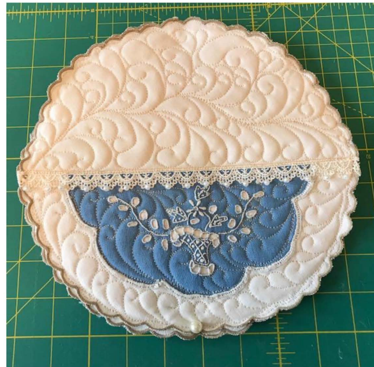
Diane Bell Needle case