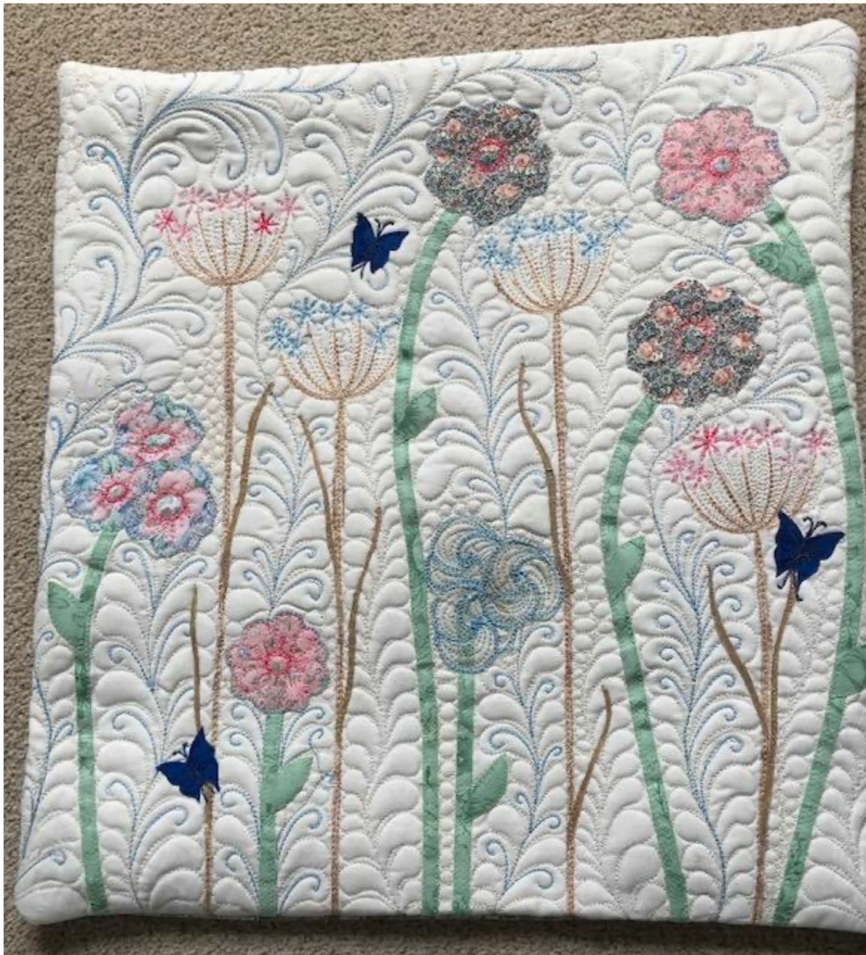
Diane Bell Cushion Cover