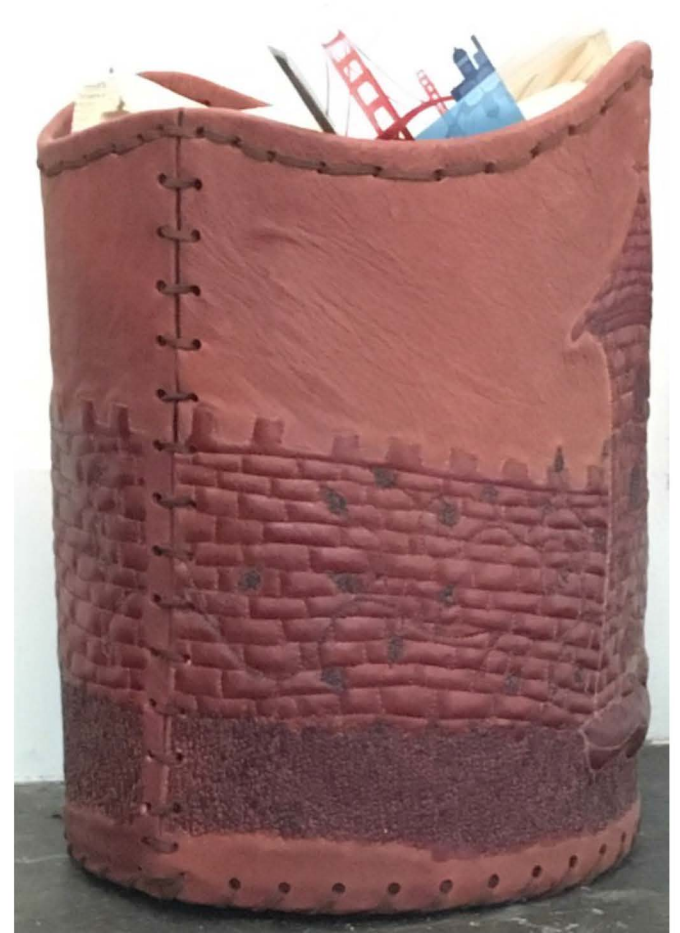
Sorcha Torrens Quilted leather kindling bucket