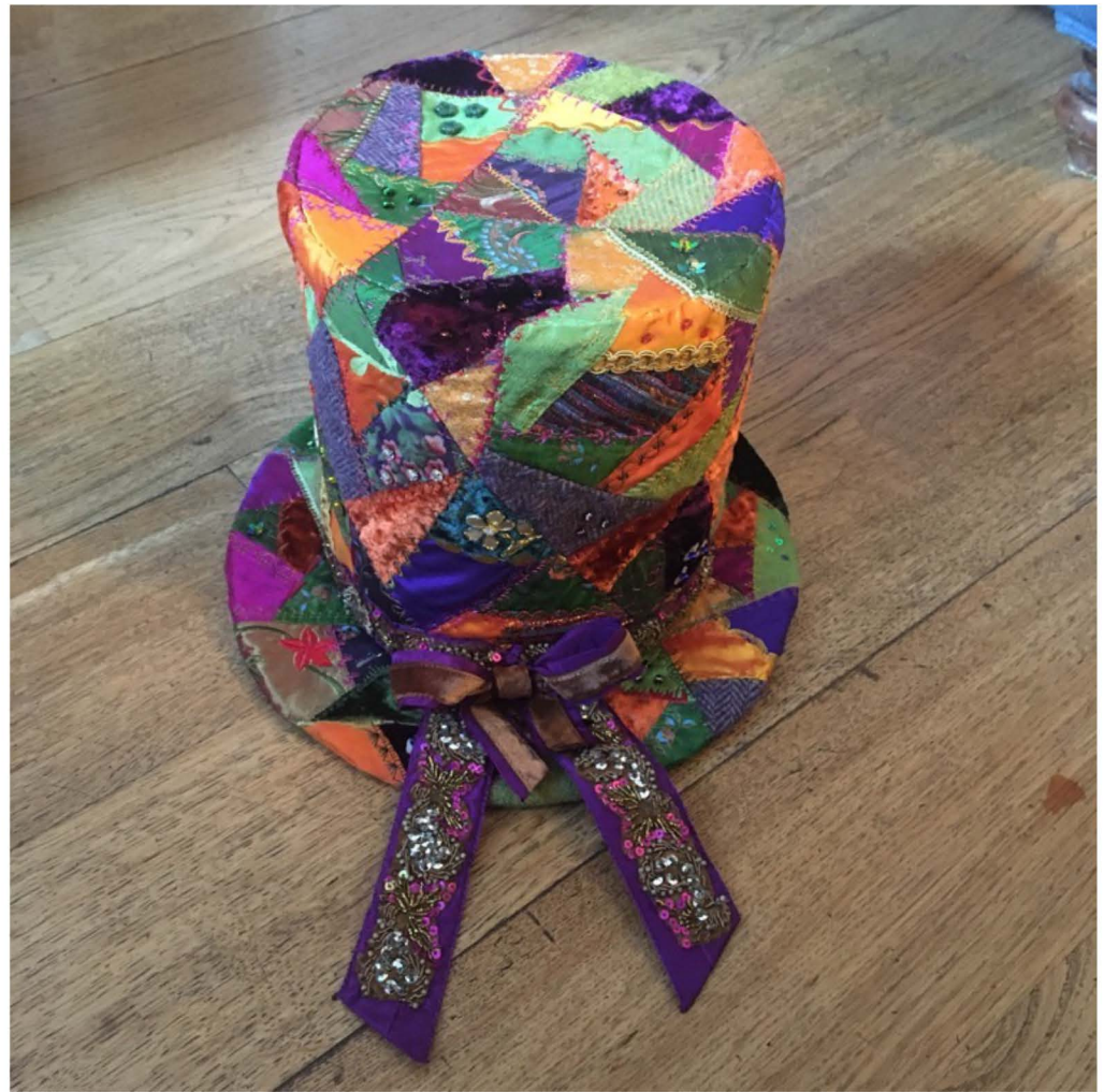
Sorcha Torrens Crazy Patchwork top hat